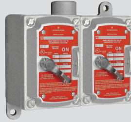
2-Gang Tumbler Switch