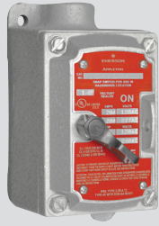
1-Gang Tumbler Switch