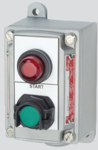
1-Gang Start/Stop Push Buttons