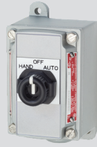
1-Gang HOA Selector Switch