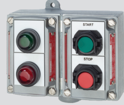
2-Gang Push Buttons & Pilot Lights