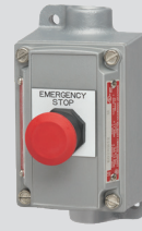
1-Gang Emergency Stop Button