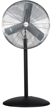
Airmaster® 71526 30"