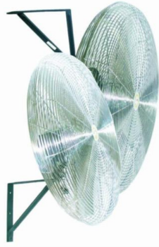
Airmaster® 71725 24"