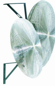
Airmaster® 71726 30"